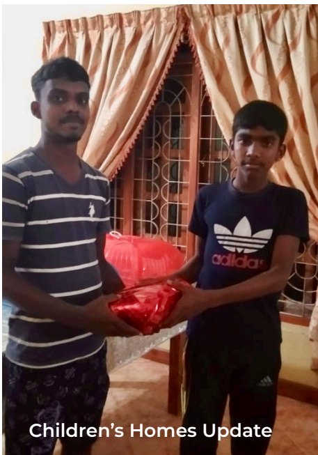
Children's Homes Update